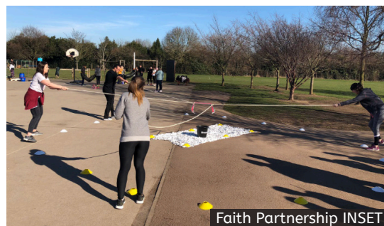
Faith Partnership INSET

South Wilford Primary School hosted a joint INSET for our Faith Partnership schools, exploring outdoor learning activities along with 'Commando Joe' team building exercises. Everyone who participated brought great energy and enthusiasm to the tasks and took away lots of inspiration for developing outdoor learning back at school.