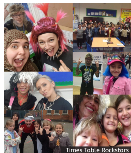
Times Table Rockstars

Huge congratulations to Brocklewood Primary School for winning our Year 3/4 Athletics Championship on Monday 11th February. Parkdale were runners up. Brocklewood will now progress to the Nottingham City Finals, along with Burford Primary. Thank you to all of the schools for participating, we hope you enjoyed the event.